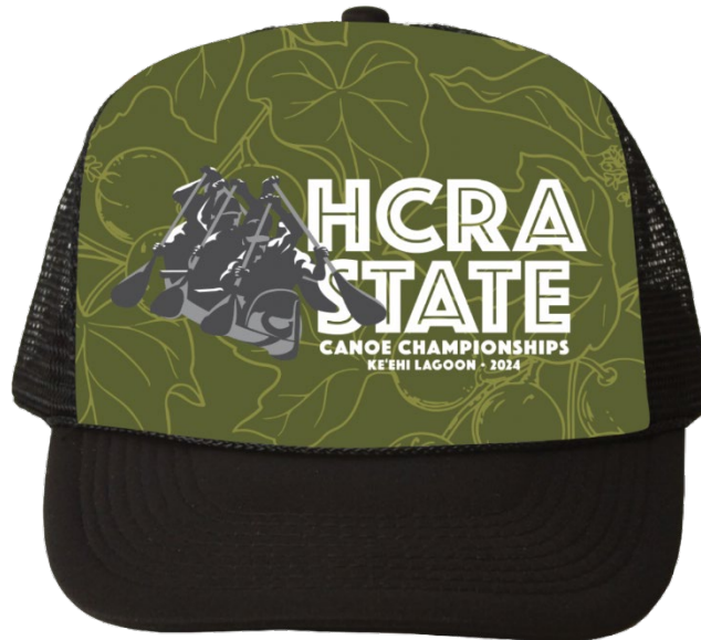
Mesh trucker with kukui design. Get the matching zip hoodie and cooler chair.