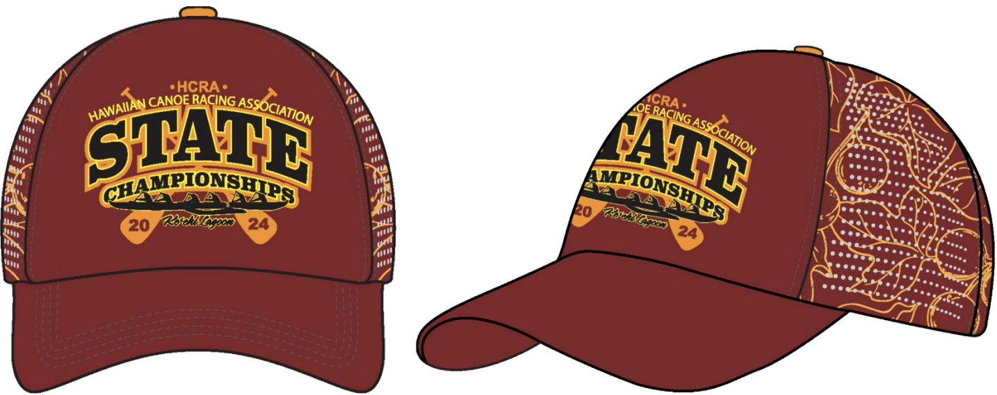
Maroon paddling cap, laser perforated. Shorter crown than a trucker cap. Matches the Cardinal Triblend shirt and Wahine Racerback in Black.